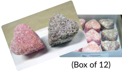
(Box of 12)

Our Lamington creation filled with dark chocolate ganache or raspberry jam in the shape of a love heart. Just lovely.