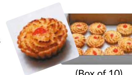
(Box of 10)

The beauty of shortbread tarts is its never-ending variety you can make. This one is filled with a delicious mixture of coconut, milk and honey.