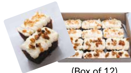
(Box of 12)

No slicing, no wastage and no double handling A tender individual loaf in the two traditional flavours..