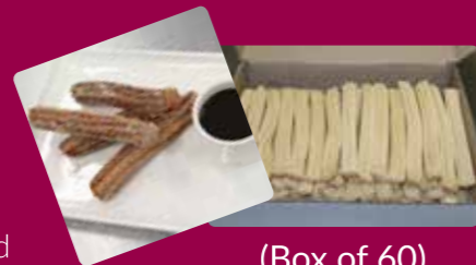
(Box of 60)

Yes! The Spanish straight donut that you can cook yourself right out of the freezer. Crunchy on the outside, soft and tasty on the inside. Really yummy...Olé!