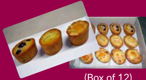
(Box of 12)

Wholesome and tasty Friands presented in assorted flavours. If you like almonds this is the product to eat.