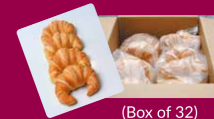
(Box of 32)

For many years we have been making one of the best croissant in Australia. Hand made and 100% butter. Available also in cocktail size.