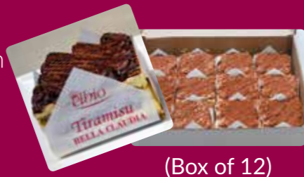
(Box of 12)

The traditional Italian combination of coffee, liquor and Mascarpone cheese presented in slice form will entice your taste buds.