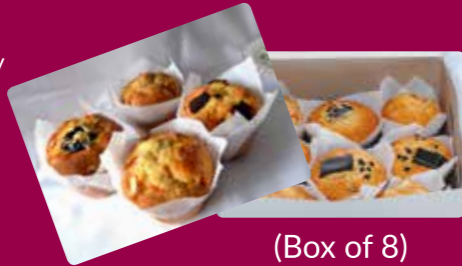
(Box of 8)

Assorted flavours of our own recipe provides a tender, crumbly muffin ready to enjoy with any hot infusion.