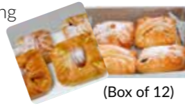
(Box of 12)

Our Danish is a complete feast! Pastry and filling combine in a wholesome variety of flavours.