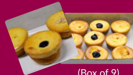
(Box of 9)

For those who like baked cheesecake this is the one to have. Add a good cup of tea or coffee to accompany it and just enjoy. Assorted flavours.