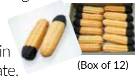
(Box of 12)

Butter Vienna style shortbread presented in finger form. Filled with apricot or raspberry jam, dipped in dark chocolate.