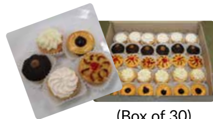
(Box of 30)

Ideal for parties or just to sell individually to the consumer that wants something sweet and not feeling guilty about it. Assorted flavours.