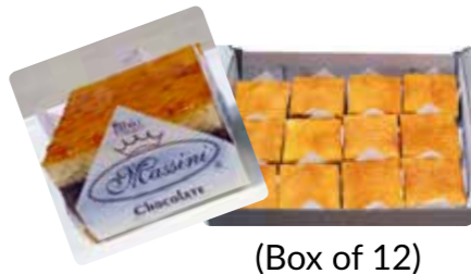
(Box of 12)

Chocolate mousse style cream between layers of tender sponge cake with a flame caramelised topping.