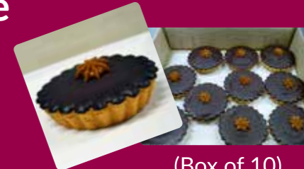
(Box of 10)

Creamy caramel in a crispy shortbread tart topped with chocolate to provide an irresistible combination.