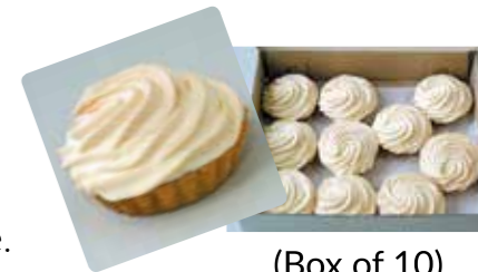
(Box of 10)

Easy to eat tangy lemon curd encased in a crispy shortbread tart topped with fluffy meringue.