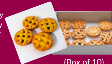
(Box of 10)

Light crumbly shortbread tarts with the taste and aroma of Grandma's delicious baking. Box of assorted flavours.