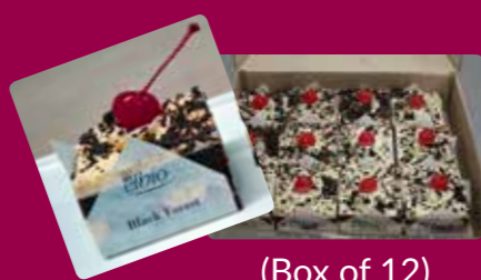
(Box of 12)

The traditional cake in slice form; light and tasty extravaganza of black cherries, cream and a hint of cherry brandy.