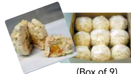
(Box of 9)

Nothing will beat the luscious taste of Chaja with its irresistible combination of caramel, sponge cake, cream, fruit and meringue.