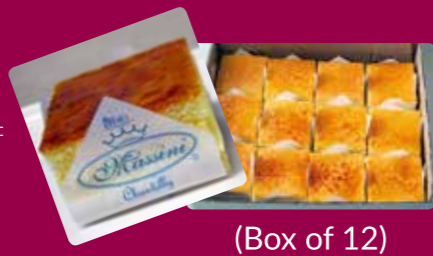
(Box of 12)

Chantilly cream between layers of tender sponge cake with a flame caramelised topping. A thrilling dessert.