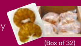
(Box of 32)

No butter, no milk, no eggs. The usual Elbio quality and vegan.