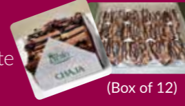
(Box of 12)

The perfect blend of Chocolate Sponge, Caramel, Chocolate Cream, Blackberry and Chocolate Meringue.