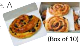
(Box of 10)

Light and tasty butter Danish pastry rolled with fruit and our own custard recipe. A big favourite. Also available in vegan.