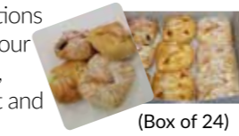
(Box of 24)

This smaller size Danish is ideal for breakfast functions and comes in four flavours: apple, cheese, apricot and blueberry.