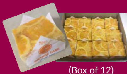
(Box of 12)

Moist, sweet and smooth orange and coconut cake slice that tastes as good as it looks.