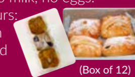
(Box of 12)

No butter, no milk, no eggs. Three Flavours: Apple, Peach & Apricot and Blueberry.