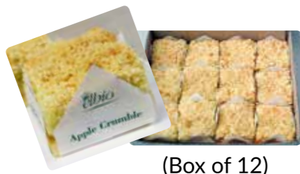
(Box of 12)

Butter crumble covers tender sweetened apple slice on a base of a sponge cake. You can serve it warm with cream or ice cream.