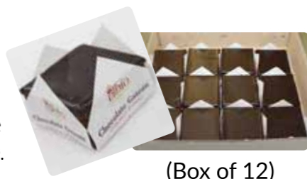
(Box of 12)

Light and moist chocolate gateau slice filled and topped with chocolate ganache to enhance even more its chocolaty taste. Recommended to be served warm.