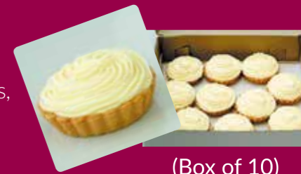
(Box of 10)

For lovers of the biting taste of citrus, this creamy lemony curd is encased in a delicious crusty shortbread tart, topped with a citrus sweet icing.